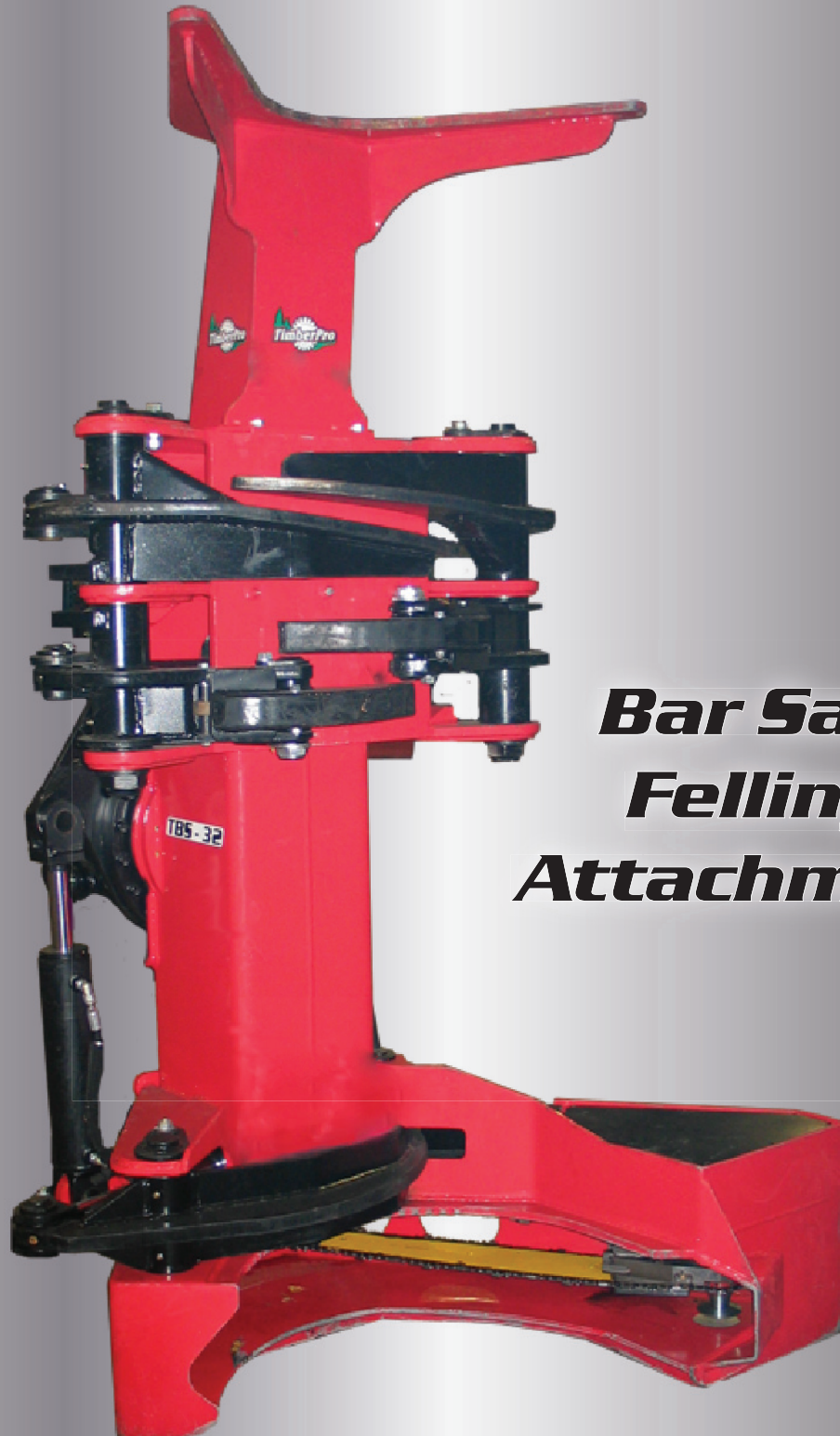
Bar Saw Felling Attachment